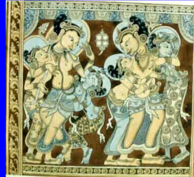
Tantric deities and their female counterparts Minanthu (13 th century A D)