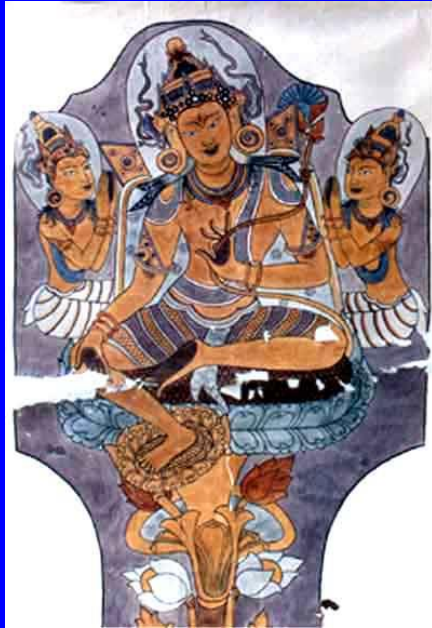
Seated Bodhisattva on double lotus throne Abeyadana Temple