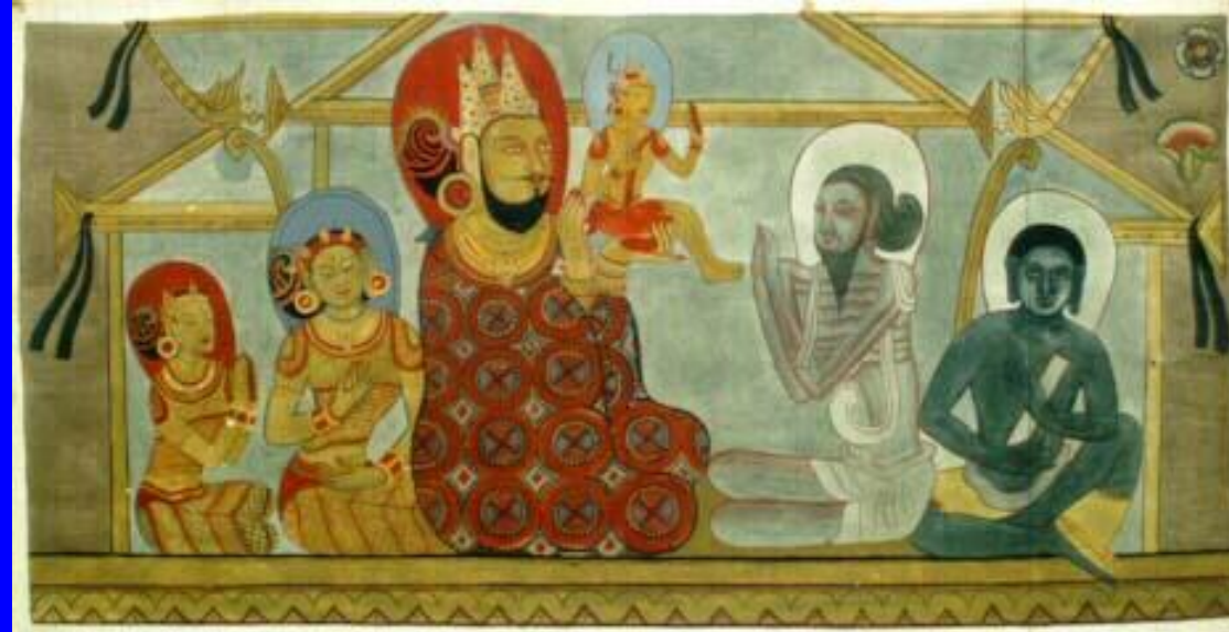
Pathothamya Temple (11th Century A.D)

The ascetic Kaladevila paying homage to the Embryo Buddha. In this scene the ascetic Kaladevila predicted that the infant would become the Buddha.