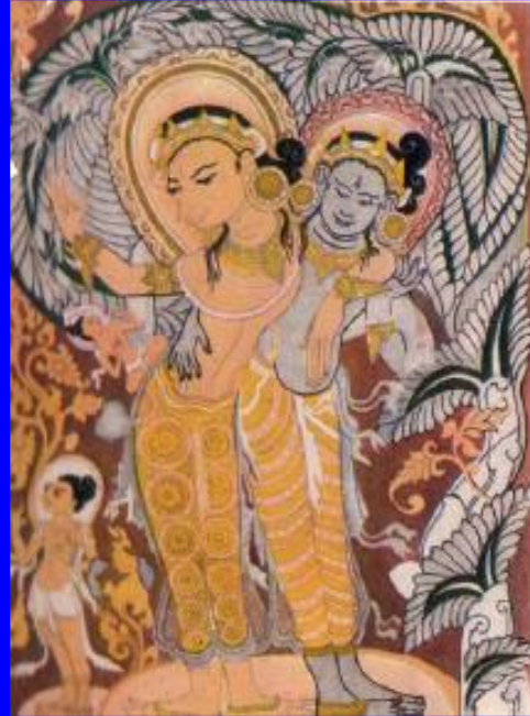
The Nativity Minanthu (13 th century A D)