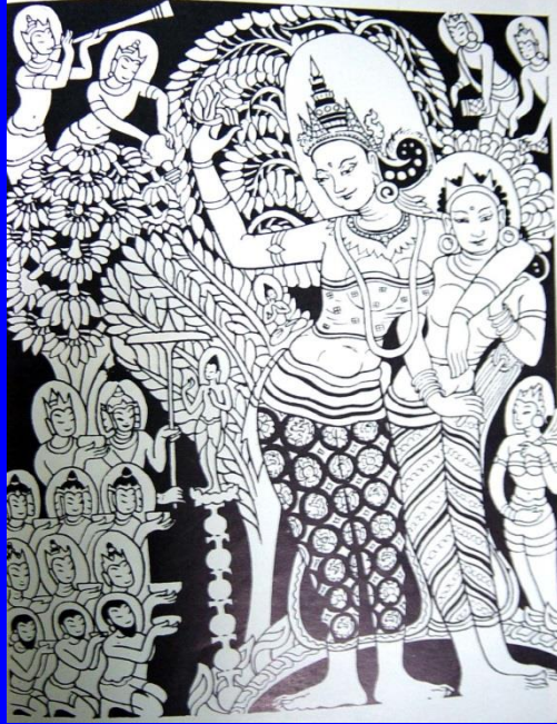
The Nativity, Reproduced Lokahteikpan (12 th Century A.D) (The Lokahteikpan, Ba Shin, BHC, 1962