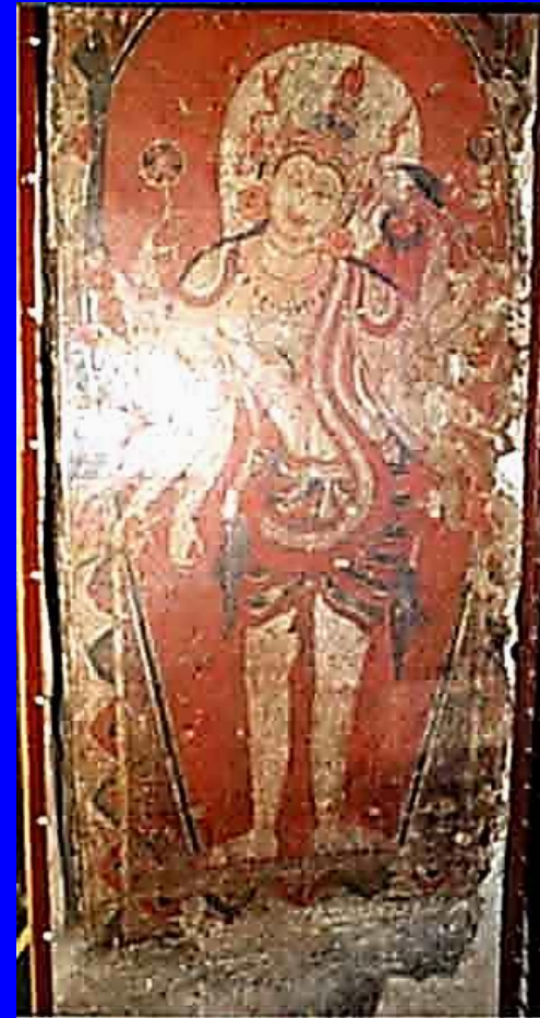
Fourteen armed Bodhisattva Myinkaba Kubyauk Gyi Temple

tribhaṅga pose and halo round on the head