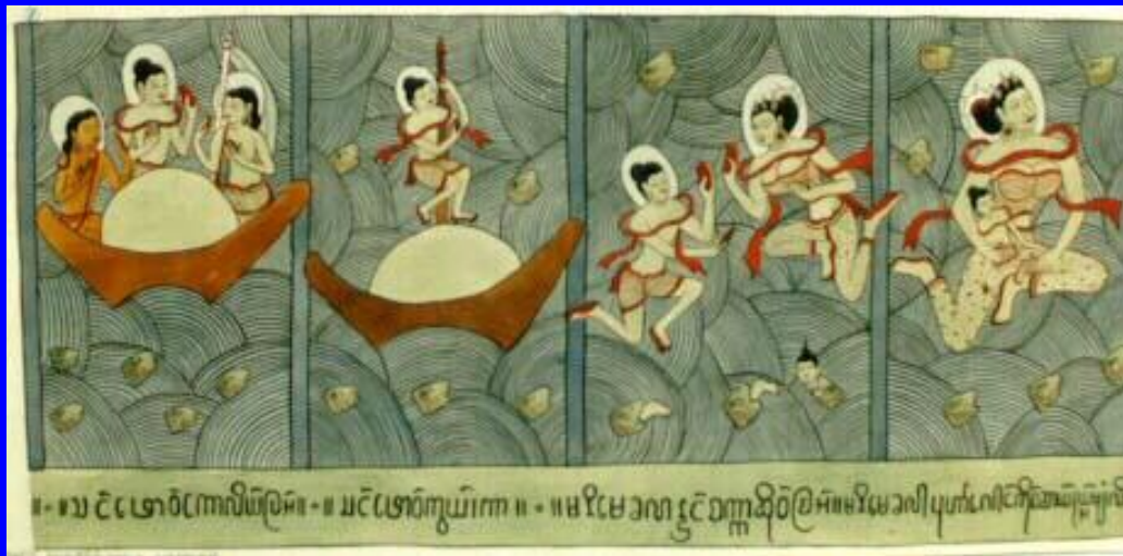
The ship-wreck; and Janaka's conversation with Manimekhalā