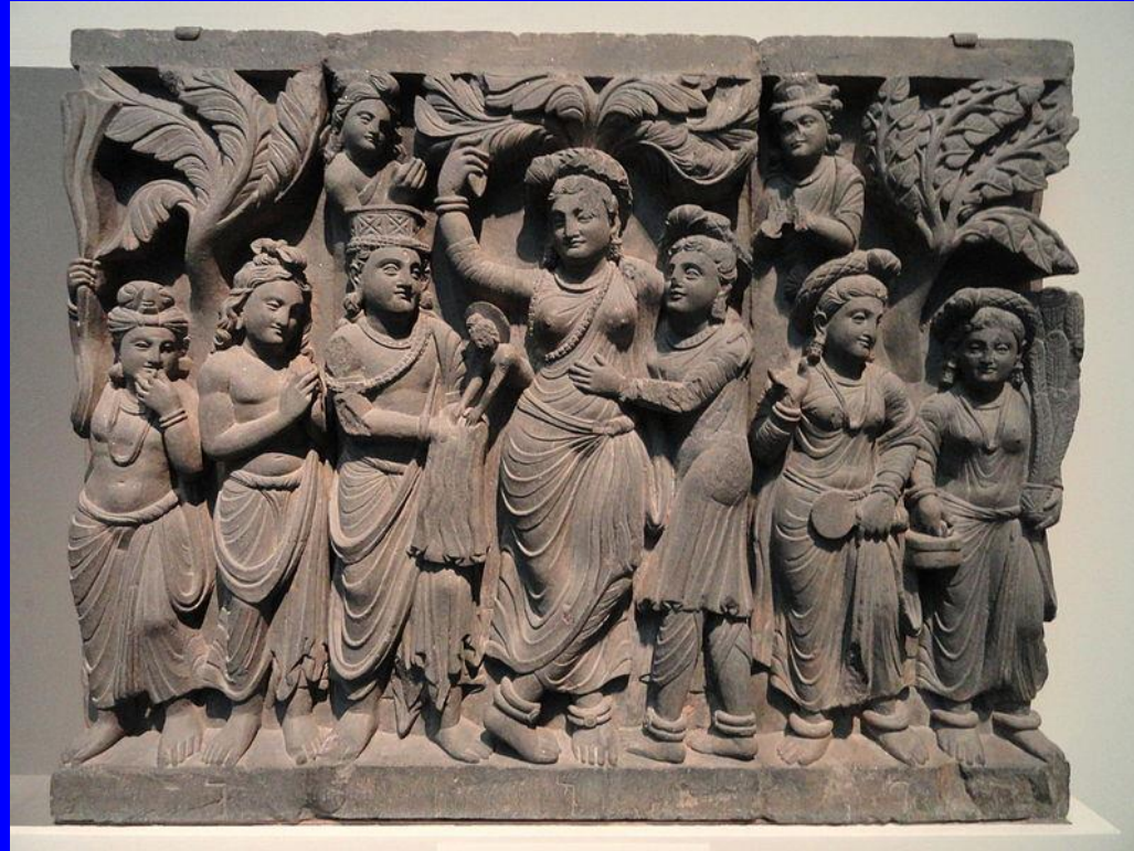
Birth of the Buddha, Kushan Dynasty, late 2nd to early 3rd century CE.